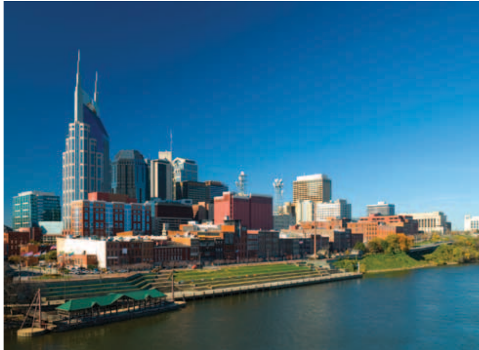
Nashville, Tennessee. The cost of importing coal is a drain on Tennessee's economy, which relies heavily on coal-fired power. Investments in energy efficiency and homegrown renewable energy can help stimulate the economy by redirecting funds into local economic development—funds that would otherwise leave the state.

The Tennessee Valley Authority (TVA), a federally owned corporation that produces electricity, purchases nearly all the state's imported coal. TVA's Cumberland plant, in Cumberland City, is the most import-dependent power facility in Tennessee, having spent $314 million in 2008. The plant is the fourteenth-largest source of carbon dioxide emissions (the main cause of global warming) among hundreds of coal plants nationwide.