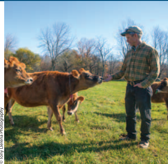
Organic dairy cows—such as the ones shown here at an organic dairy farm in Maine—have a greater amount of forage in their diet than conventional dairy cows.

The justification for revenue pooling is based on the equity principle that if each dairy is producing an identical commodity, they all should receive the same minimum price. However, these orders were first established in the 1930s—when dairies were much smaller and well before the organic sector even existed. Organic milk is not identical to conventional milk. Organic milk is produced through different farming practices, has a different nutritional con-