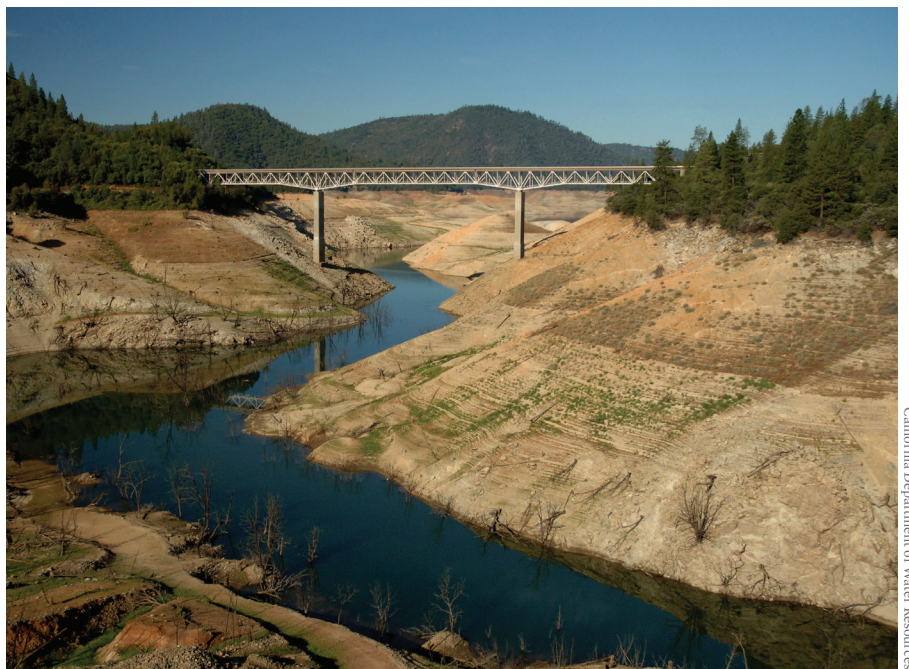
California Department of Water Resources

For more than a century, California has relied on its snowmelt-fed reservoirs, rivers, and streams for the majority of its water. Drought and climate change are depleting those traditional supplies, with California snowpack reaching a 500-year low (Belmecheri et al. 2015). The state surface-water storage system is not designed for a future in which precipitation is expected to come as rain rather than snow; it will consequently not be able to deliver adequate supplies. We must therefore change how we collect and manage our dwindling water resources. California is increasingly turning to groundwater to meet its water needs, so the focus must shift to making groundwater supplies more reliable and sustainable to ensure enough water for generations to come.