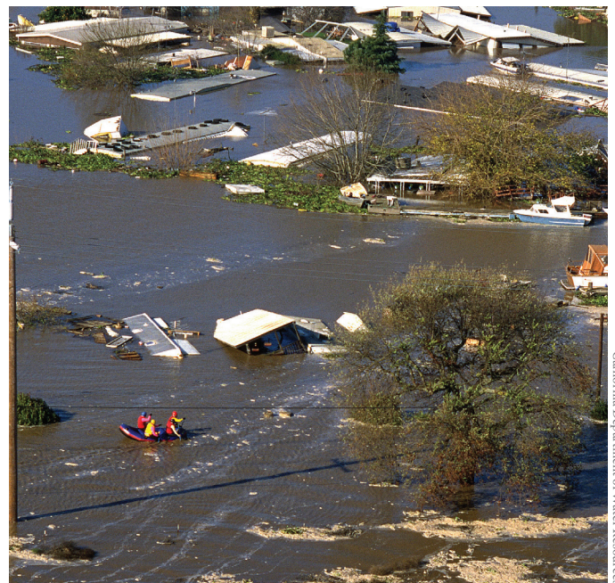
California’s four-year drought has left land so parched that it is difficult for rainwater to infiltrate the soil when it finally does arrive. This can lead to sudden and violent surface runoff, creating floods (such as this one in Carmel). Redesigning storm-water capture and groundwater recharge systems can help reduce flooding and store water to use during dry periods.

In addition, our water systems are not built to store a rapid onslaught of water. In California, we have a series of dams located in the Sierra foothills, built to hold snowmelt as it is slowly released from mountain snowpack over the spring months. The reservoirs created by these dams are not as useful when there is little snow. They are also not useful when there is too much rain during the winter because they must release most of their water to ensure that floodwaters do not overtop their dams. In addition, pavement, downspouts, gutters, and sewer systems in cities force heavy rain to run off the urban landscape quickly. This not only contributes to flooding, but