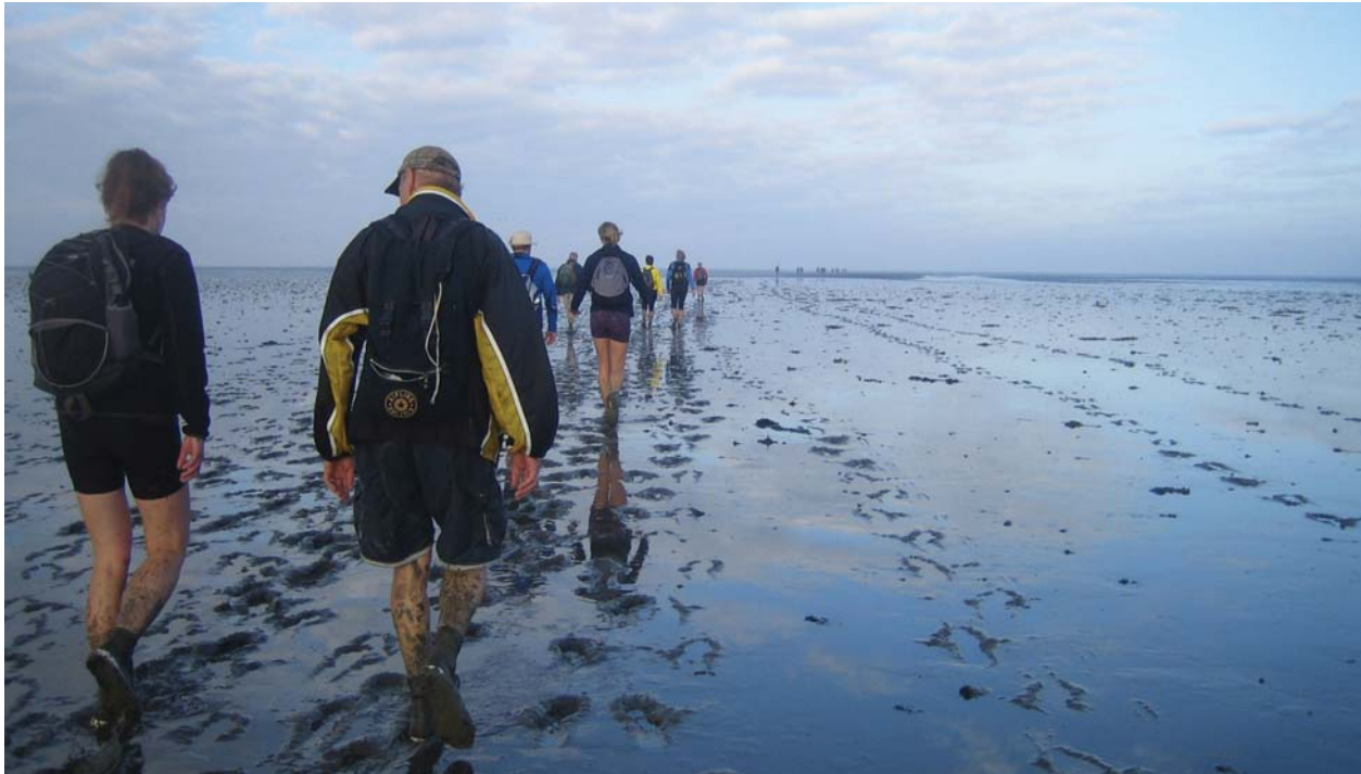
The Wadden Sea attracts about 10 million visitors a year.

may cause a loss of intertidal flats and salt marshes, leading to a decline in foraging and nesting possibilities for migratory and breeding birds (MELUR-SH 2015; Bairlein and Exo 2007; Brinkman et al. 2001). As a result of temperature rise, the plankton at the base of the food web may change, which could lead to changes higher up in the food web, including lower reproduction levels of fish populations and decreasing bird populations (NEAA 2014). In an ecosystem as complex as the Wadden Sea, the effects of climate change may also result in a cascade of yet unknown but wide-ranging changes.