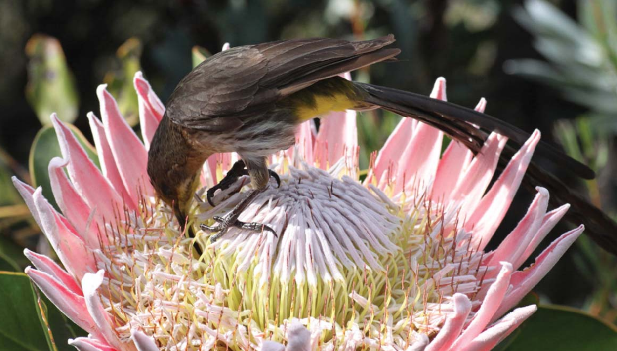
Changes in populations of fynbos pollinating species, such as this Cape sugarbird feeding on a king protea, could have major implications for the ecosystems of the Cape Floral Region Protected Areas of South Africa.

and canoeing; cultural tourism; and visits to historic cities and buildings (UNWTO 2008).