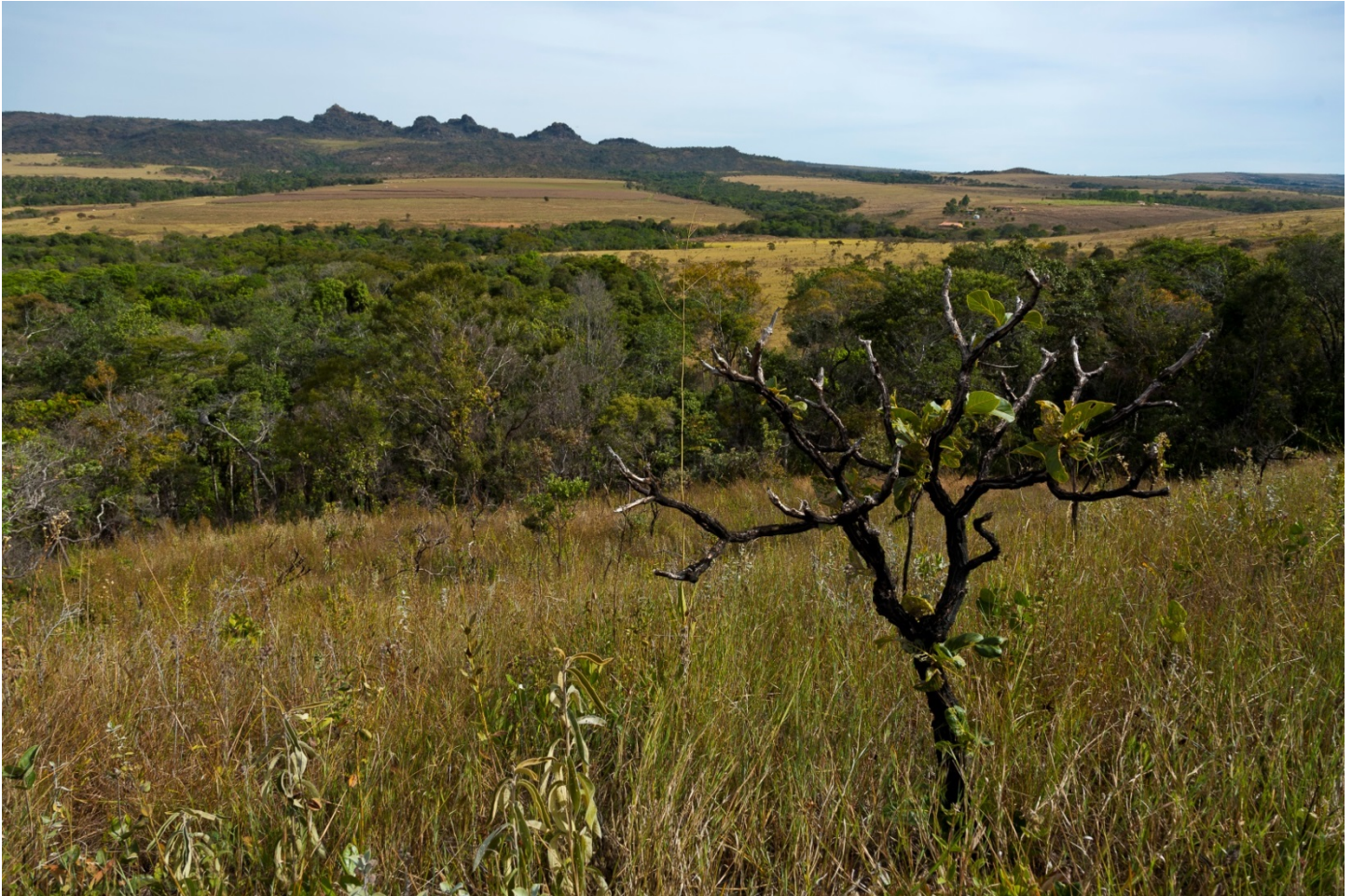
The Cerrado biome is a mosaic of grassland, savanna, and dry forest.

carbon stored in the soil range from 97 to 210 tC/ha (Bustamante et al. 2012; Batlle-Bayer, Batjes, and Bindraban 2010). The carbon sequestered in soil is relatively secure from fire or drought (Veldman et al. 2015), unless disturbed by agriculture. In some ways, the carbon stored in the Cerrado may be more stable than that stored in other ecosystems, where greater amounts of carbon are usually stored in aboveground vegetation. However, the true carbon content of the Cerrado has long been underestimated because underground carbon is less obvious than that in aboveground vegetation and can also be more difficult to monitor and estimate.