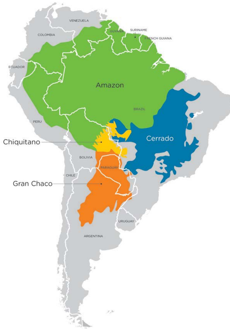
FIGURE 1. Biomes in South America at Risk of Conversion

The Cerrado covers nearly a quarter of Brazil's land mass and is the country's second largest biome. Pictured above are some of the regions at risk of land use conversion.