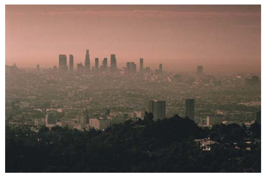
Many regions of California rank among the worst in the country for air quality. Reduced air pollution is an important "co-benefit" of efforts to reduce global warming emissions. LA smog photo courtesy of the Environmental Protection Agency.

Methane and several other toxic gas emissions, like benzene, are lower, in part because the global warming emission reduction efforts are shifted to the methaneintensive agriculture and landfill sectors. <sup>1</sup>