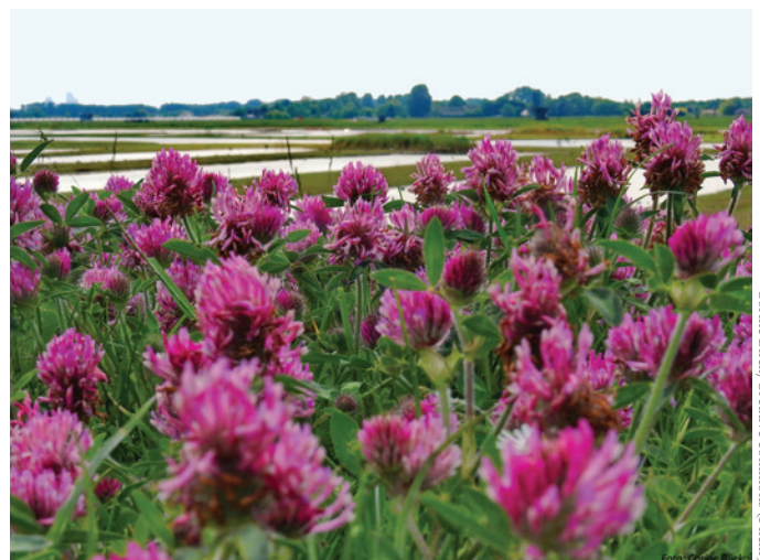
Cover crops, such as red clover shown here, can be planted when main crops aren't growing. They prevent erosion, soak up nutrient-rich water before it escapes to surrounding waterways and help build soil health.

Another way for farmers to improve soil health is through crop rotations involving three or more crops, rather than just one or two. Such crop rotations break up pest cycles (thus reducing the need for pesticides) and can incorporate crops that have a variety of additional benefits. For example, there is growing interest from Midwestern farmers in incorporating small-grain crops such as oats, wheat, barley, rye, and triticale into corn-soybean systems (Greenaway 2017). 2 Rotated with summer corn and soybeans, these cool-season grain crops help keep soil protected and leave farmers time to grow cover crops. In another example, Montana farmers have found that crop rotations that include lentils—a legume requiring little moisture—have helped build soil health and increase farm resilience in an arid region (Carlisle 2015). Perennial plants provide still another way to protect soils and prevent water pollution. Farmers can grow perennial crops such as alfalfa as part of extended crop rotations, or plant small areas of perennial plants such as prairie grasses,