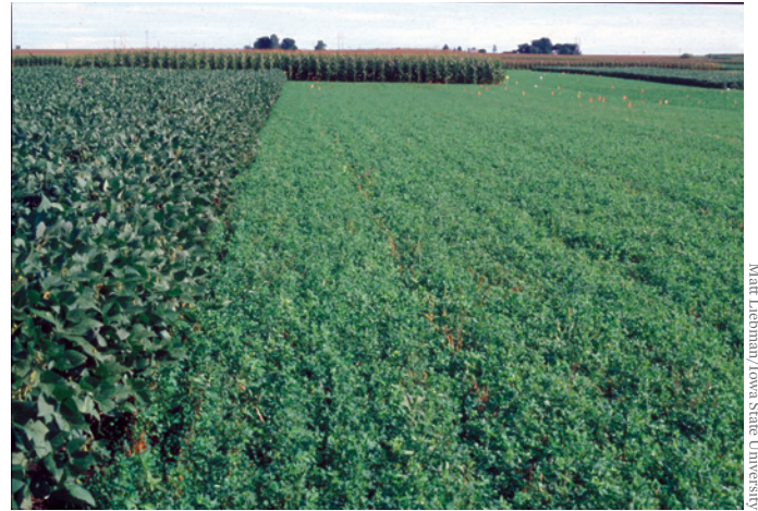
Our current agricultural system’s emphasis on monoculture—a single crop grown across a large acreage, year after year—leaves farms vulnerable to pests and degrades soil. This long-term Iowa State University experiment that rotates corn and soybeans with oats, alfalfa, and cover crops shows how farmers can break up pest cycles, reduce fertilizer and pesticide use, and prevent erosion.

Despite growing evidence of the benefits of these healthy soil practices, relatively few farmers have adopted them.